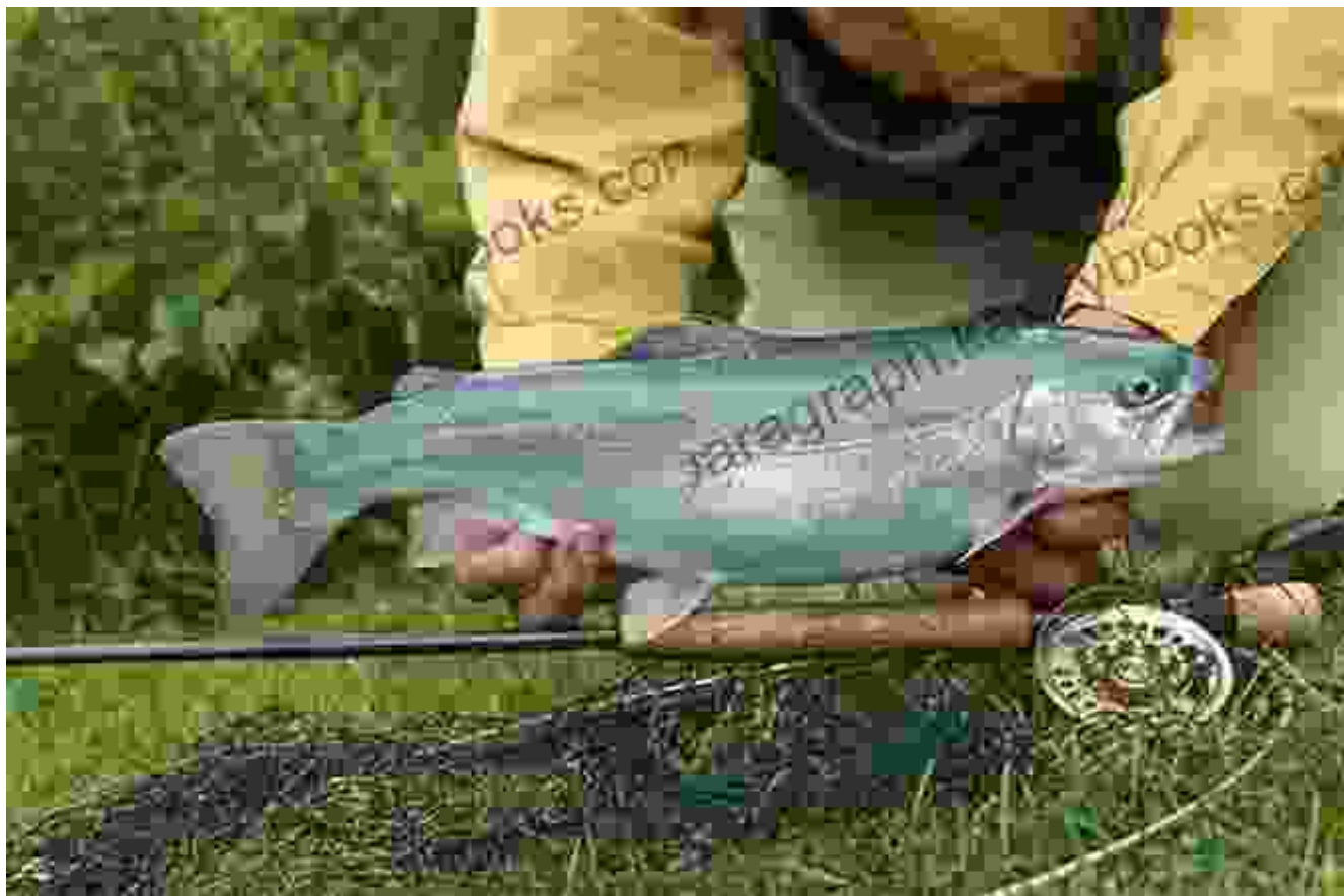
Blue trout, a delicacy from the Norwegian fjords

culinary hotspots around the globe. With stunning photography and vivid descriptions, you'll savor the delicate sweetness of fresh seafood, the earthy aroma of wild mushrooms, and the rich complexity of rare spices.